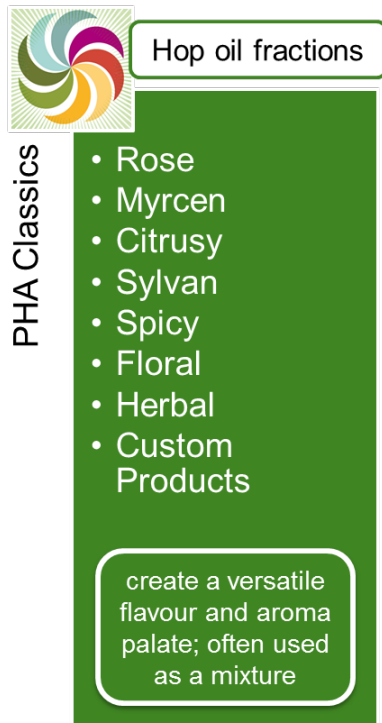
Figure 1: Range of PHA® products

PHA® Classic products are prepared from cone hops by specific extraction and distillation methods. They consist of original hop oil compounds in a propylene glycol (PG) solution. PG is a permitted carrier for flavours as per regulation 2006/52/EC. PHA® products are exclusively supplied worldwide by the Barth-Haas Group.