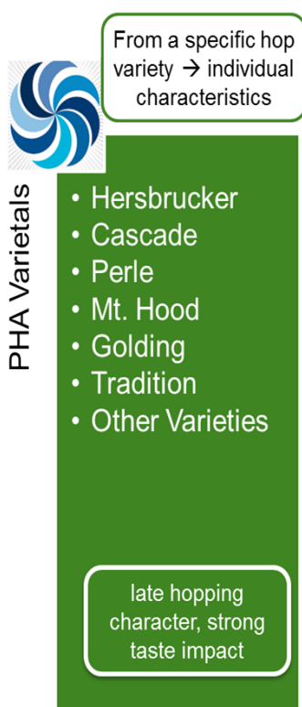
Figure 1: PHA® Varietal

PHA® Varietals are a hop extract in an aqueous propylene glycol carrier, produced by a proprietary physical separation process. It is considered as GRAS (FEMA no. 2580 - Hops, oil). Propylene glycol is registered as a food additive according to Annex II of EU Reg 1333/2008 as well as E1520 and PG is a permitted carrier for flavours as per regulation 2006/52/EC. PHA® products are exclusively supplied worldwide by BarthHaas.